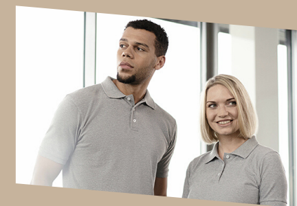
T-Shirts & Polos