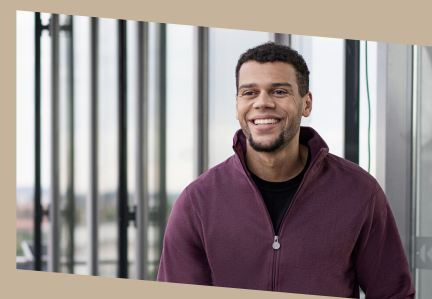
Fleece & Softshell Jackets