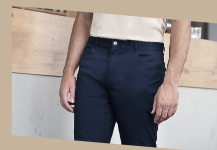
Chinos & 5-Pocket Trousers