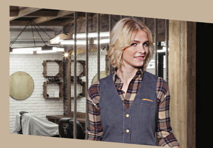
Waistcoats & Shirts