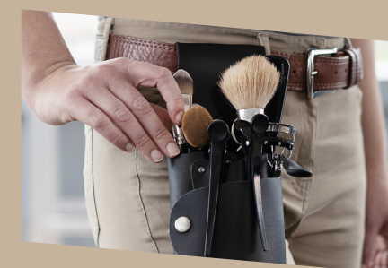
Accessoires & Shoes